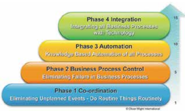
Figure 1: The Oliver Wight Maturity Model